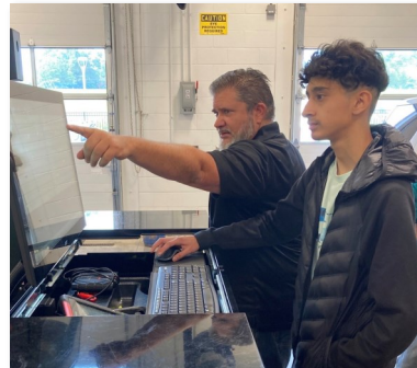
A Pre-ETS student explores career options at Catawba Valley Community College