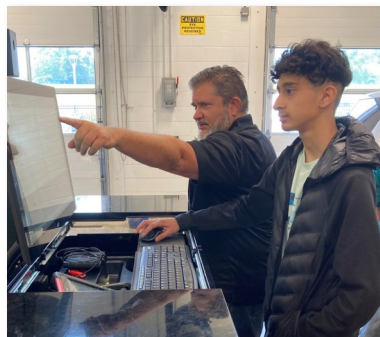
A Pre-ETS student explores career options at Catawba Valley Community College