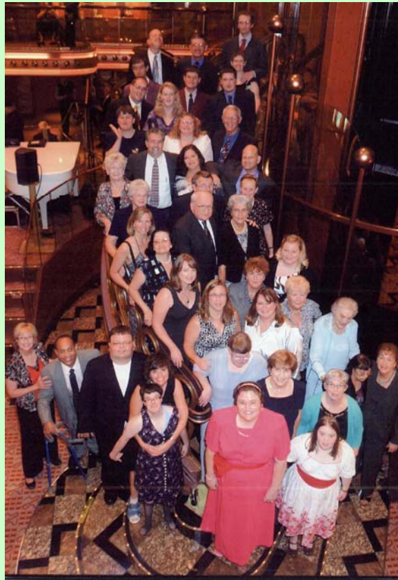
Watauga Opportunities Consumer Cruise - Fall '2010